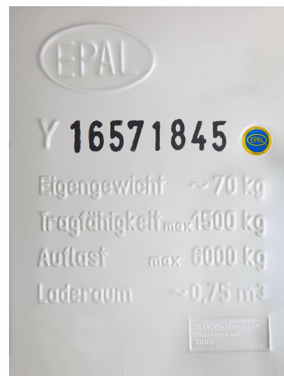
EPAL Box pallet (inscription plate)