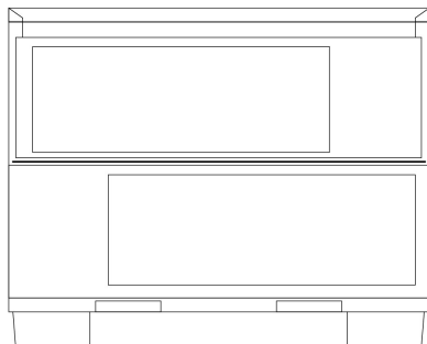
Length view 1,200 mm side