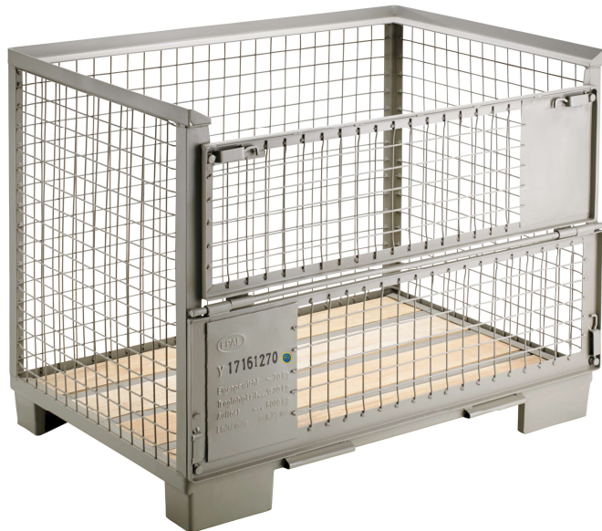
EPAL Box pallet